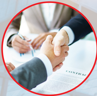
SLA (Service Level Agreement)