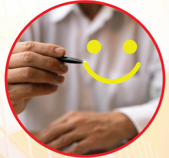
Customer Centric Approach