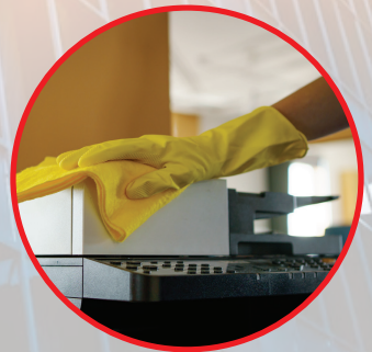
Dedicated manpower on your requirement for support