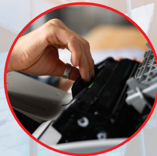
AMC (Annual Maintenance Contract)